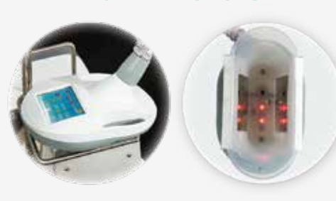
10.4" TFT touchscreen

New Technology Touchscreen Headpiece of Cryolipolysis